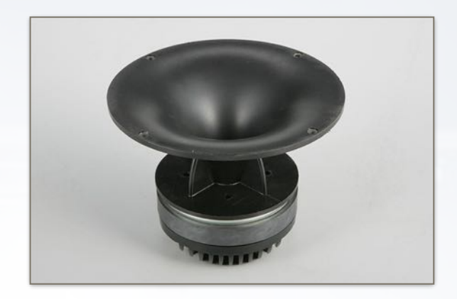
PE diaphragm with 70° x 70° waveguide