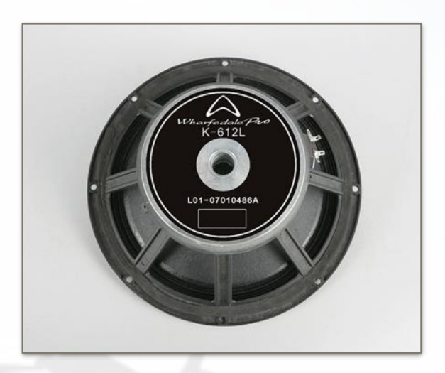
Custom LF transducer with aluminium ring for enhanced heat dissipation