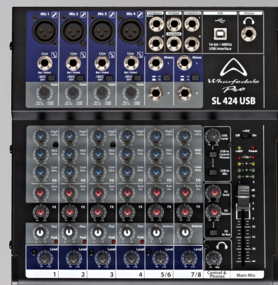
SL 424 USB

An ultra musical 3-band EQ is available on all channels, with an additional high pass filter on the mono channels. The SL 824 USB and SL 1224 USB feature a built in FX processor with 16 presets, giving you unlimited creative potential. The on-board FX is supplemented by a dedicated FX send and 2 auxiliaries.