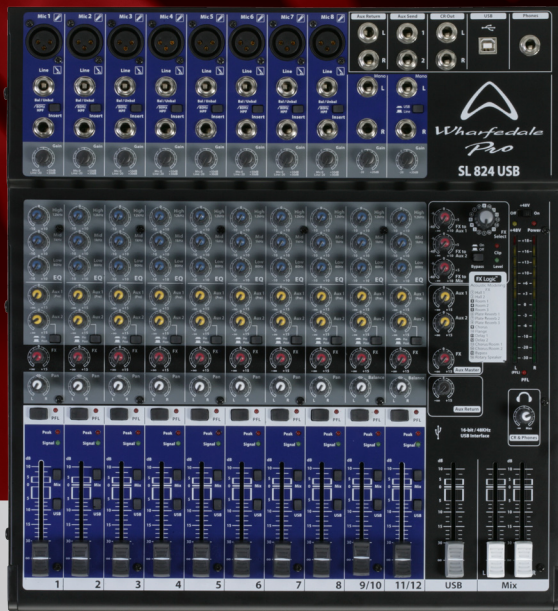
SL 824 USB