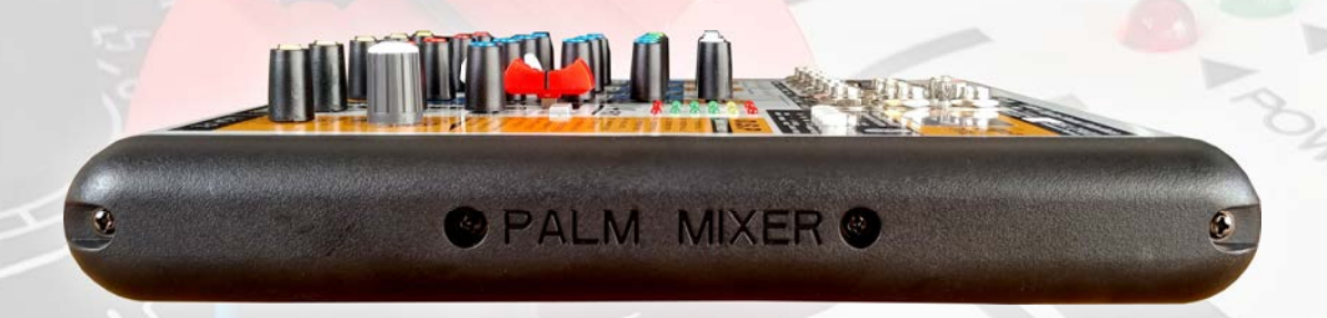
Top Side View