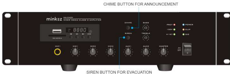
SIREN BUTTON FOR EVACUATION