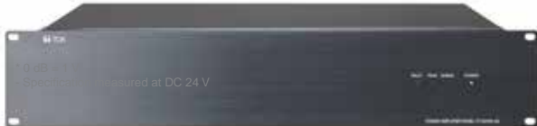
FV-224PA Power Amplifier