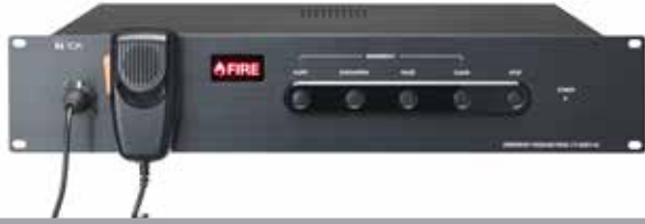
FV-200EV Emergency Message Panel