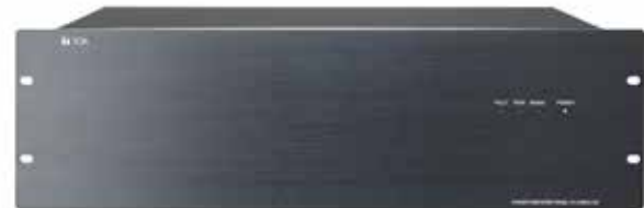
FV-248PA Power Amplifier

- Specification measured at AC 230V AC, 50Hz