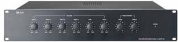
FV-200PP Pre-Amplifier Mixer Panel